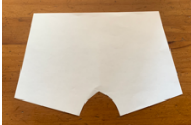
②Cut the pattern.