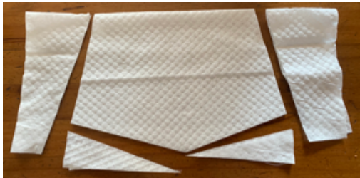
③Fold a kitchen paper in two and cut it based on the pattern. Don't cut along the dotted line, continue cutting to make a point. If possible, cut the pattern and the paper with a hand push cutter to shorten the time.