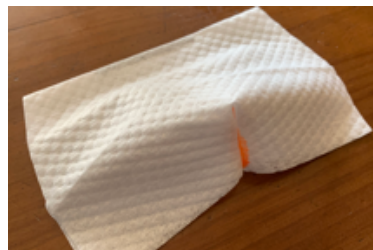
⑩Turn the mask inside out,.