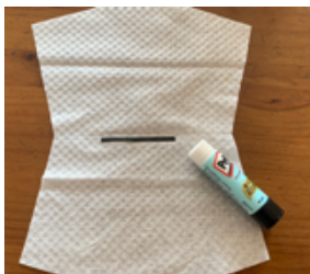
⑤Put a plastic tie in the center.