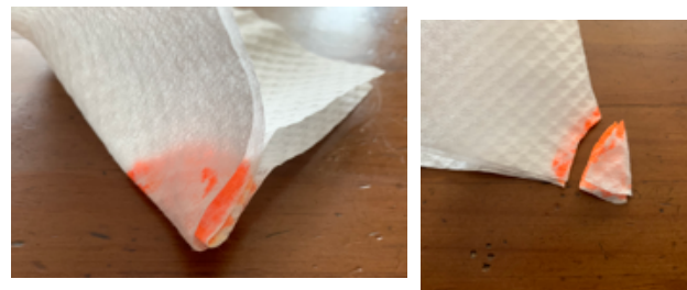
⑨Fold the orange part in half and cut off remaining the edge of it..