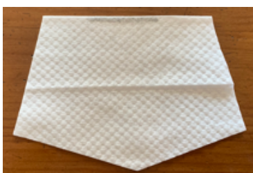
⑥Fold the mask.