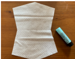
④Open the mask and put glue in the center.