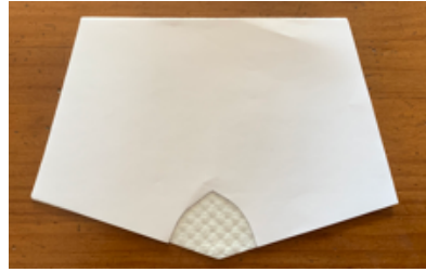
⑦Put the pattern on the mask.