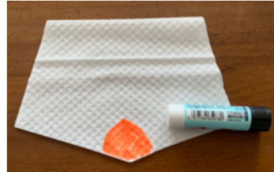
⑧Put glue on the orange colored part.