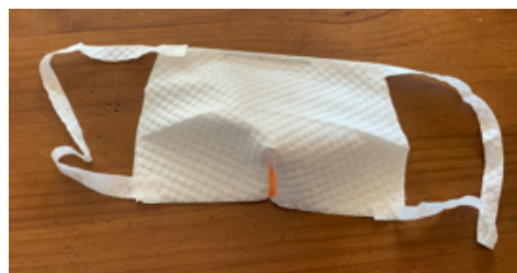
⑫Adjust the length of the ribbons and glue the ends to each corner of the mask.